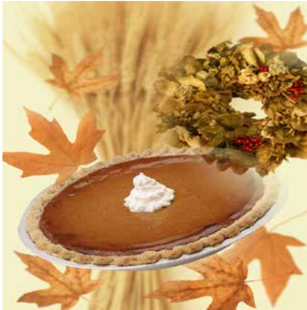
Savour the tastes of the Fall Season